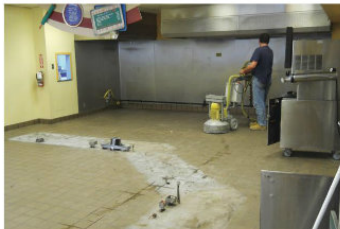
ABOVE ▲ Fortunately, most of the concrete was in good condition. In any area requiring repair, the crew used Cement All, a rapid-set, non-shrink concrete repair material.

Another advantage to the hybrid flooring system is the moisture tolerance of the urethane base coat. The Hybri-Flex MC system, which consists of Poly-Crete MD SL as the urethane base coat, tolerates moisture vapor up to 12 lbs. (5.44kg)/1,000 sq. ft. (92.90m 2 )/24 hours. Comparatively, a straight MMA system tolerates 5 lbs.