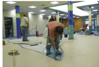
ABOVE ▲ The crew poured the Poly-Crete MD SL urethane base coat at a thickness of 1/8" (0.32cm) onto the cleaned and prepped floor.

Vasquez Jr. thinks of the Hybri-Flex MC system as a bit of an insurance policy when it comes to stopping moisture vapor from undermining the performance of the flooring system.